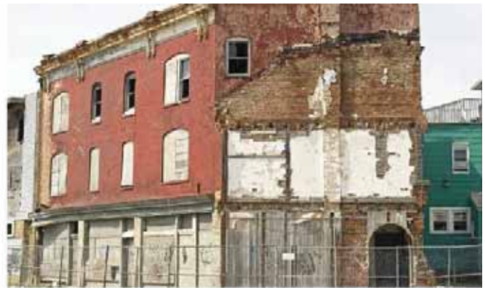
The key issues for LSRPs include administrative process and regulatory framework; general technical principles and concepts; information gathering; general site remediation; and case and site closure.

The LSRP program has had a positive impact on the ability to move cleanups ahead more quickly. However, there have been a number of issues that have arisen in the implementation of the program. By selecting the correct LSRP, and working with the LSRP to incorporate the development into the remediation, a redeveloper