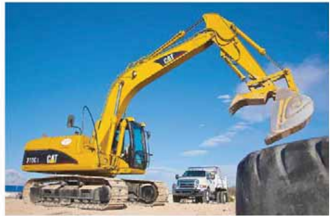
Tracking and streamlining the remediation of New Jersey's approximately 9,000 contaminated sites is now in the hands of LSRPs.

It has been somewhat of a challenge over the past three years to keep current with the evolving guidance and regulations. However, the NJDEP has been very helpful with providing advice on how to navigate this shifting landscape to keep projects in compliance. The agency has shown a genuine willingness to work with developers to ensure that projects can proceed through redevelopment in accordance with applicable laws. We at EWMA have found that the LSRP program has been a great success